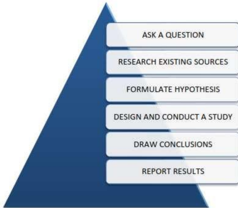
FIGURE 3: SPECIFIC ACTIVITIES OF SSI

The new framework for science education and the Next Generation Science Standards emphasise the importance of the development of science literacy and scientific practise by students. In order for these objectives to be achieved, students need to be able to conduct scientific investigations, analyse and explain data, use evidence to support claims and participate in scientific discussions. Teachers must be incorporated into a context in order to authentically incorporate these processes into their classroom. For this work SSI provides ideal contexts. The research framework we have presented is not intended as a step-by-step guide for teachers; rather, it is a template that provides the elements required for SSI-based teaching. Practitioners can use this model to include essential features when using SSI. Curriculum designers can use this framework to effectively integrate social issues with the content of science. This framework can be used by professional developers and administrators to help teachers implement SSI-based instructions. Finally, researchers could use this framework for the conceptualization and research of SSI-based instruction features. The framework that we have presented can be used by a variety of stakeholders to facilitate the implementation of SSI training in the classroom, and help students to develop scientific literacy and to engage in scientific practises.